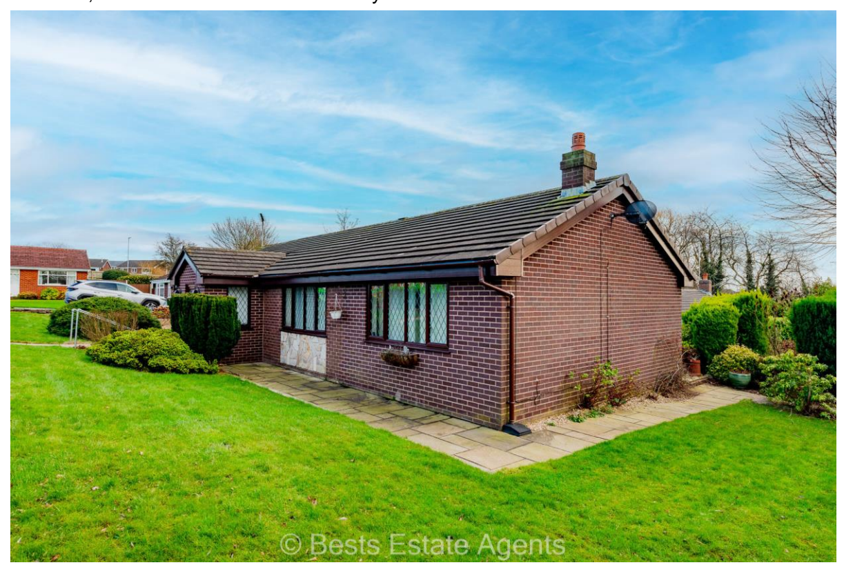
Thinking Of Selling Your Property? No Sale No Fee - Call Now.

Property stands in a appealing corner cul-de-sac position having gardens to three sides with an extensive laid lawn garden with recently paved pathways and mature perimeter hedge rows. Whilst to the rear of the property, there is a detached double garage with useful storage space above and metal up and over door, large recently paved driveway provides ample off road parking, there is also a fully enclosed garden with paved patio areas, laid lawn and mature shrubbery.